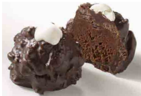
F101420213019 - Mint Cookie Crunch

Milk mousse ganache center, dipped first in dark chocolate, then milk chocolate, drizzled with white chocolate, topped with sprinkles and a jelly bean.