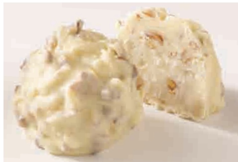
F101420123057 - Italian Cream Cake

Graham cracker crumbs accent the rich roasted marshmallow and milk chocolate center that is enrobed in milk chocolate and decorated with white chocolate.