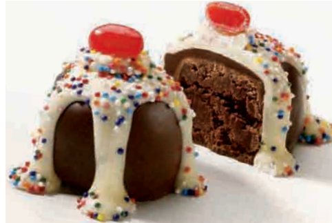
F101200212821 - Party Hardy™

Creamy pumkin center, dipped in dark chocolate, then in milk chocolate.