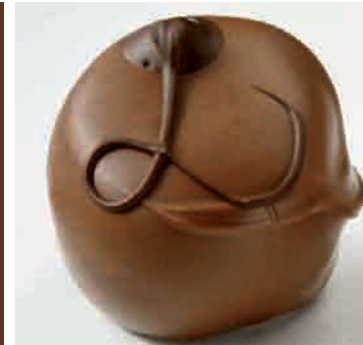
Grand Truffle 1.5 oz

These truffles are shown Actual Size . See our complete line of truffles and the sizes each is available in. (All truffles are not available in all three sizes.)