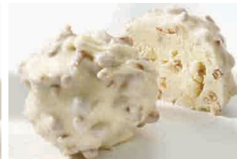
F101420212906 - Butter Pecan Roasted pecans mixed in a white chocolate ganache center with butter-pecan flavoring, dipped in white chocolate with pecan pieces.