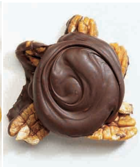
FI01320313085 - 1.5 oz Dark Pecan