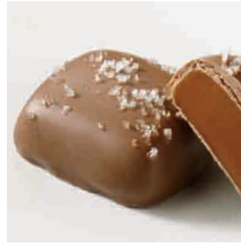
F101640311180 Milk Chocolate Sea Salt Caramel