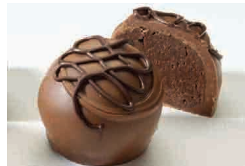
F101420211381 - Butter Rum

Creamy coconut and milk chocolate center, dipped in dark chocolate, then in milk chocolate.