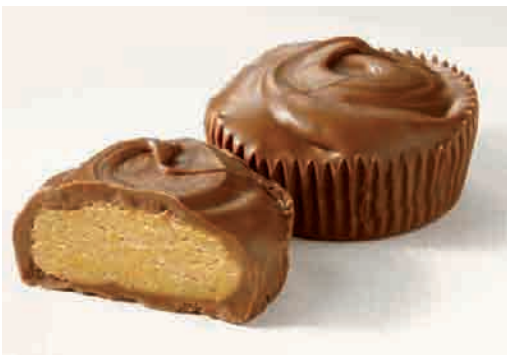
F101420311081 Milk Peanut Butter Cup