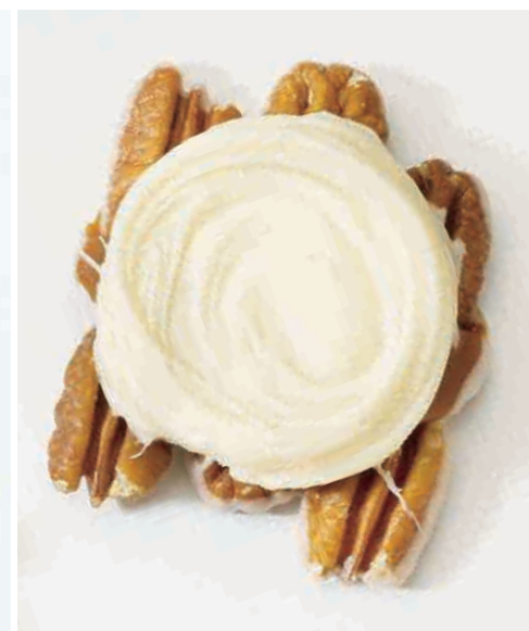
FI01320313047 - 1.5 oz White Pecan