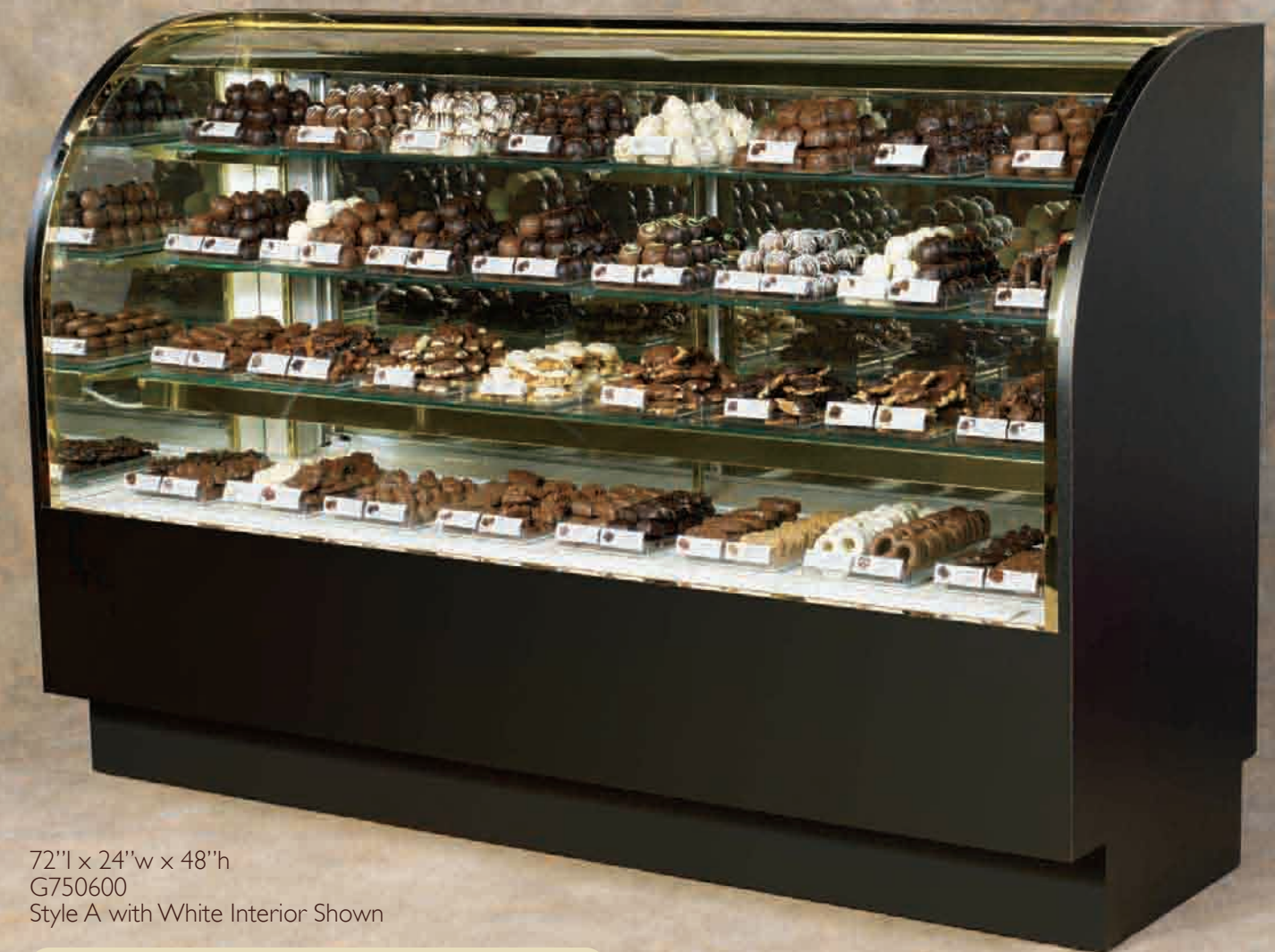
72"l x 24"w x 48"h G750600 Style A with White Interior Shown