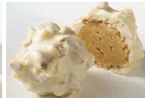
F101420211664 - PB. & Pretzel Crunch A rich, smooth peanut butter center is hand-dipped in white chocolate and packed full of salty pretzel pieces.