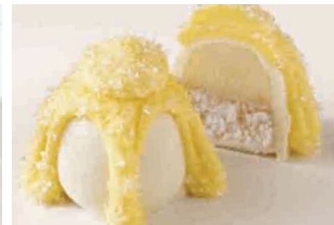
F101240213033 - Piña Colada

Rich dark chocolate center with butter and rum flavorings, dipped twice in milk chocolate.