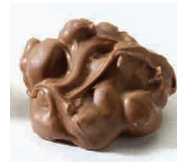
F101840412207 Milk Peanut Cluster