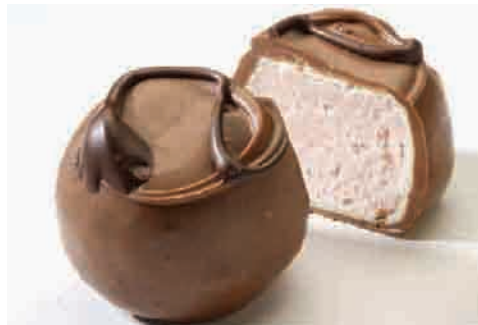
F101420211688 - Raspberry Refreshing raspberry purée and white chocolate center; immersed in white chocolate, then in milk chocolate.