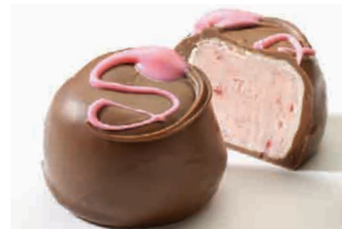
F101420211695 - Strawberry Sweet strawberry purée and white chocolate center, dipped in white chocolate, then in milk chocolate.