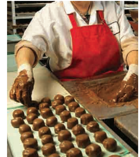
Every handmade chocolate is hand-dipped to ensure complete coverage, a deep luster and a unique appearance.