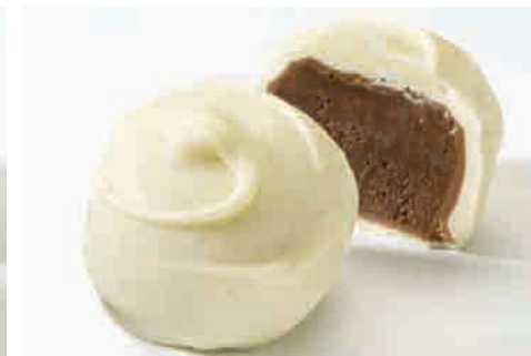
F101420211534 - White Russian Dark chocolate center infused with White Russian coffee liqueur flavor; immersed in milk chocolate, then in white chocolate.