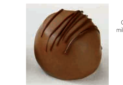
F101280811673 Fudge Love® Our signature truffle with a milk chocolate, whipped cream center; immersed in dark chocolate, then in milk chocolate.