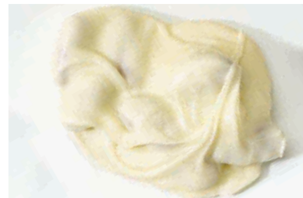
F101320311753 - White Almond Bar