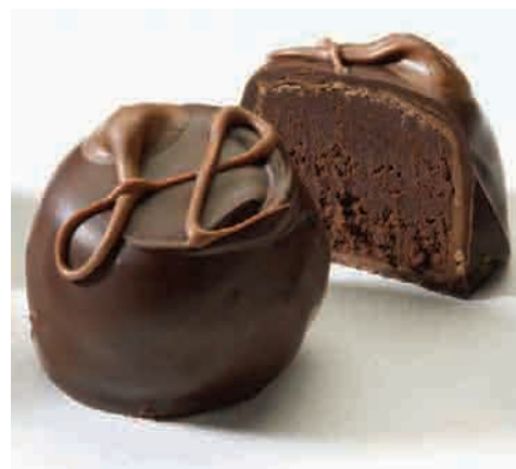
F101420211633 - Double Chocolate Rich dark double chocolate center, dipped in milk chocolate, then in dark chocolate.