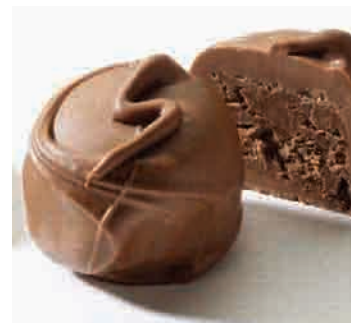
F101840412467 Milk Chocolate Truffle