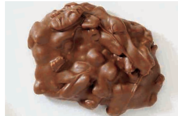
F101320311777 - Milk Pecan Bar