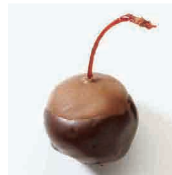
F101500111247 Double-Dipped Cherry