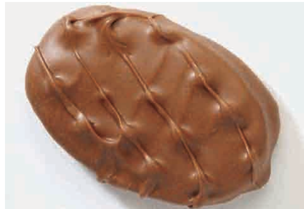
F101420311005 - Milk Praline Bar