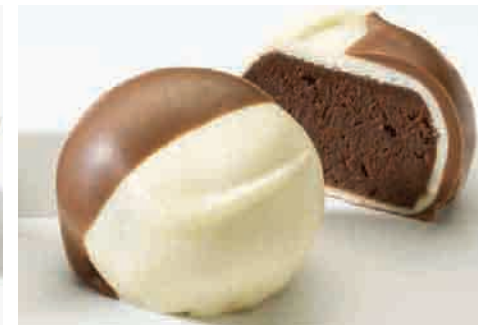
F101420211558 - Irish Coffee Dark chocolate center blended with Irish coffee flavor; dipped in milk chocolate, then in white chocolate.