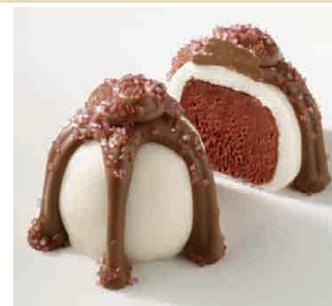
F101420212968 - Red Velvet Cake Silky smooth and luxurious red velvet chocolate center is covered in white chocolate, drizzled with milk chocolate and topped with crystallized sugar.