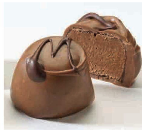
F101420211800 - Mousse Lightly whipped milk chocolate mousse center, dipped in dark chocolate, then in milk chocolate.