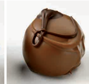
Mini Truffle .75 oz