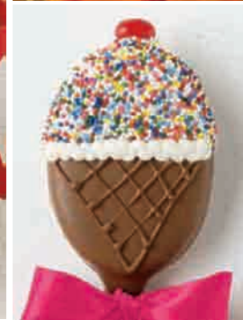
Truffles on a Stick