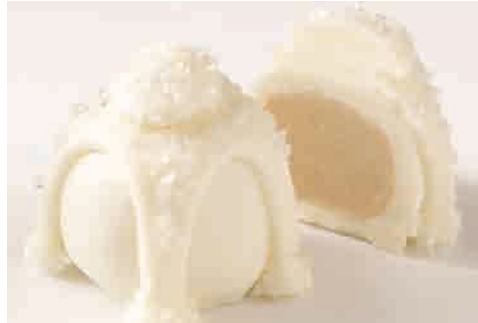
F101240213040 - Wedding Cake

Dark chocolate ganache center, twice dipped, once in milk chocolate and once in dark chocolate, drizzled with white chocolate, topped with sprinkles and a jelly bean.