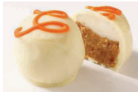
F101420213026 - Carrot Cake

Fresh and fragrant lemon zest adds texture and mouth-feel to a white chocolate center blended with Meyer lemon flavoring, twice dipped in dark chocolate.