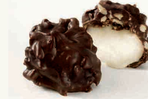
F201450010021 Dark Chocolate Annaclairs®