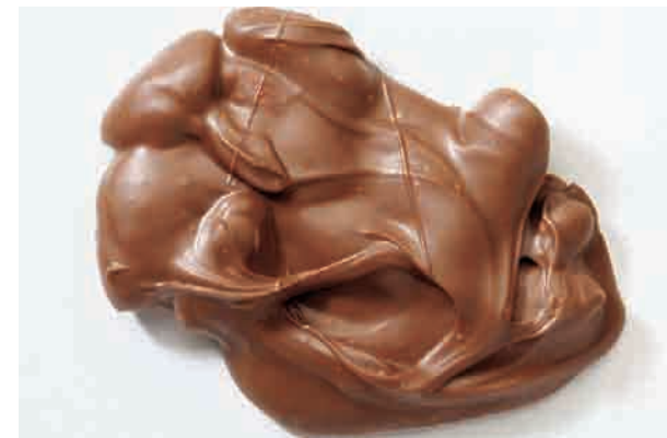
F101320311760 - Milk Almond Bar