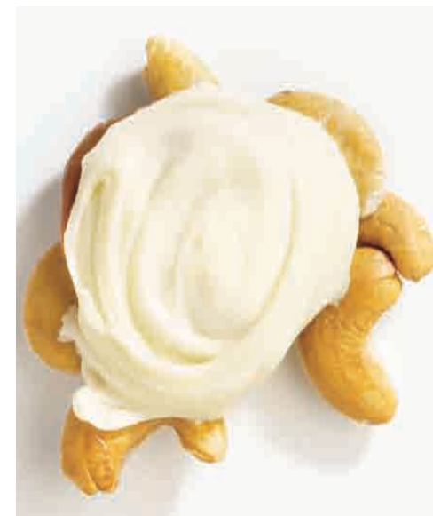
FI01320313061 - 1.5 oz White Cashew