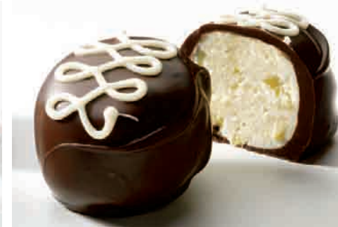
F101420212913 - Meyer Lemon

Smooth and creamy milk chocolate ganache infused with an all-natural Mexican coffee flavoring, dipped in white and milk chocolate.