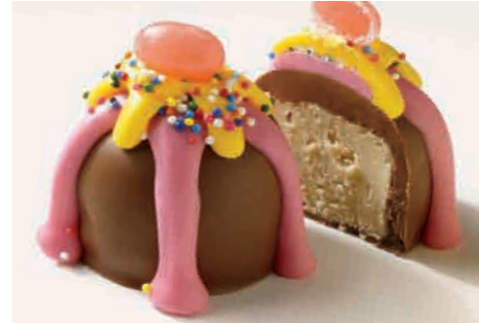
F101200830841 - Confetti

A cake-flavored buttercream ganache center enrobed in white chocolate drizzled with white chocolate and topped with crystalized sugar.