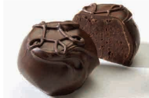
F101420211701 - Dark Raspberry Decadent dark chocolate center blended with raspberry purée, dipped twice in dark chocolate.