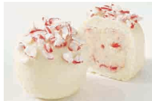
F101420211978 - Peppermint White chocolate center made with peppermint oil and peppermint pieces dipped in white chocolate and topped with peppermint shavings.