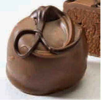
F101840111018 Fudge Love® Our signature truffle with a milk chocolate, whipped cream center, immersed in milk chocolate.