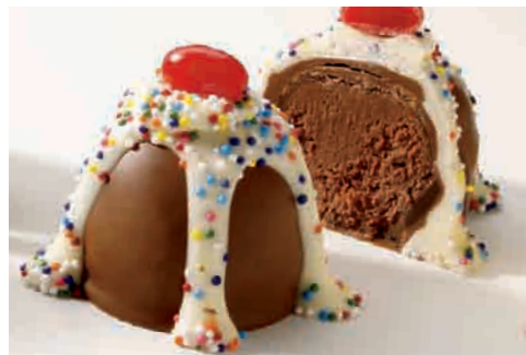
F101200212869 - Funfetti™

White chocolate center infused with lemon and lime flavorings dipped twice in white chocolate.