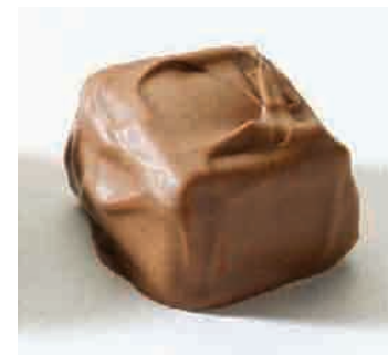
F101840412269 Milk Caramel