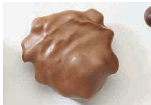
F101840311036 Milk Pecan Caramel