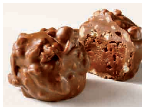
F101420111018 Milk Fudge Love®