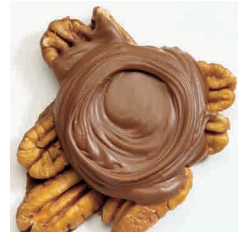
FI01320313030 - 1.5 oz Milk Pecan

A cluster of fresh whole pecans, covered in a dollop of sweet caramel and topped with a swirl of milk chocolate make our Milk Pecan Brags® our most famous and popular Brags®.