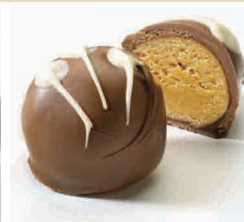
F101420211794 - Peanut Butter Creamy peanut butter center, dipped in dark chocolate, then in milk chocolate.