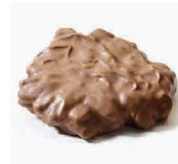
F101640412306 Milk Pecan Caramel