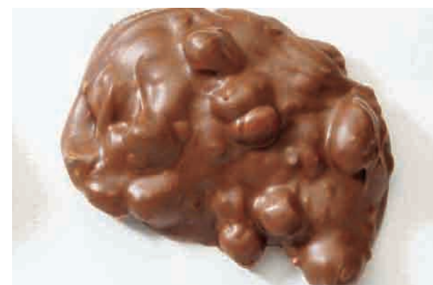
F101320311890 - Milk Peanut Bar