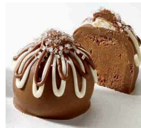
F101200212883 - Over The Top™ Caramel crème brûlée ganache center, coated twice in milk chocolate, and sprinkled with sugar crystals.