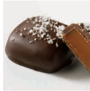
F101640311166 Dark Chocolate Sea Salt Caramel