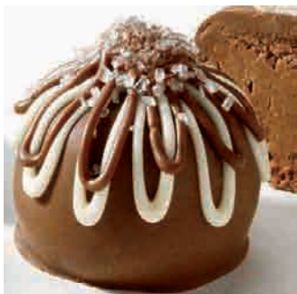
F101200212883 Over The Top™ Caramel crème brûlée ganache center; coated in milk chocolate, and sprinkled with sugar crystals.