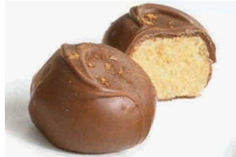
F10142021367 - Pumpkin

Creamy pumkin center, dipped in dark chocolate, then in milk chocolate.