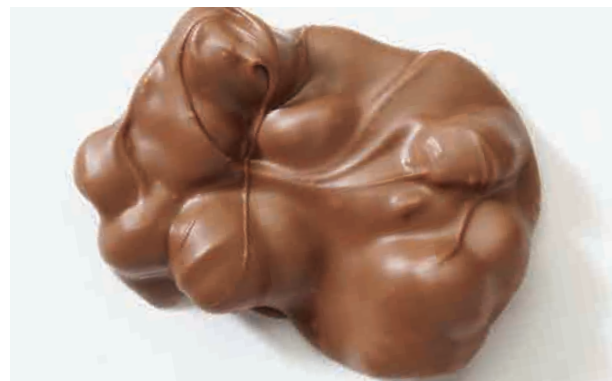
F101320311821 - Milk Macadamia Bar