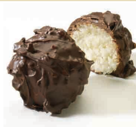
F101420211770 - Coconut Creamy-sweet coconut center, dipped in smooth milk chocolate, then in dark chocolate.

For Sweet Shop USA®, celebrating 40 years of handmade chocolates as a family-owned chocolate manufacturer known for gourmet, all natural, and OU Kosher certified handmade truffles, toffee, Famous Brags®, and Fudge Love®, the contest is a great way to gather consumer feedback on new flavors developed in their test kitchen.