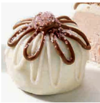
F101200212852 Showgirls™ White chocolate blended with strawberry and raspberry purée, coated in white chocolate, sprinkled with sugar crystals.