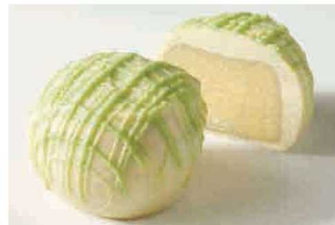
F101420700175 - Keylime Chiffon

A rich ganache center of Mexican hot chocolate combined with roasted Hatch green chilies, dipped in dark chocolate then hand rolled in cinnamon, chilies and cocoa to complete this rich truffle.