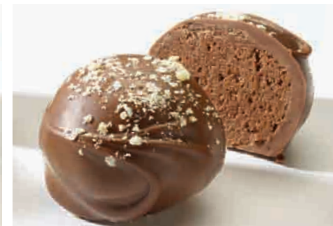
F101420211930 - Hazelnut Whipped milk chocolate center, double-dipped in milk chocolate and sprinkled with ground hazelnuts.