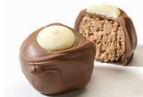
F101420211435 - Coconut Cream Pie

Thin mint chocolate cookie crumbs add a cool crunch to the dark chocolate shell surrounding the creamy milk chocolate ganache center.