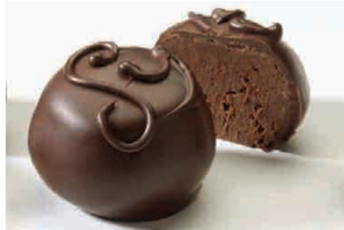
F101420211817 - Tiramisu Rich dark chocolate infused with tiramisù flavoring, dipped twice in dark chocolate.