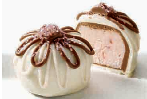
F101200212852 - Showgirls™ White chocolate blended with strawberry and raspberry purée, coated in milk and white chocolate, sprinkled with sugar crystals.