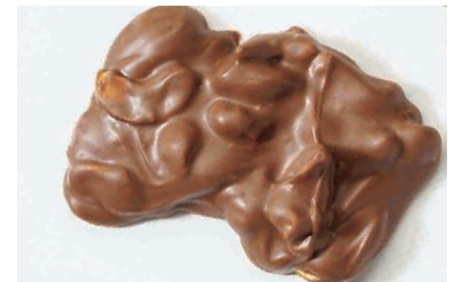
F101320311807 - Milk Cashew Bar