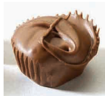
F101840412252 Milk Peanut Butter Cup