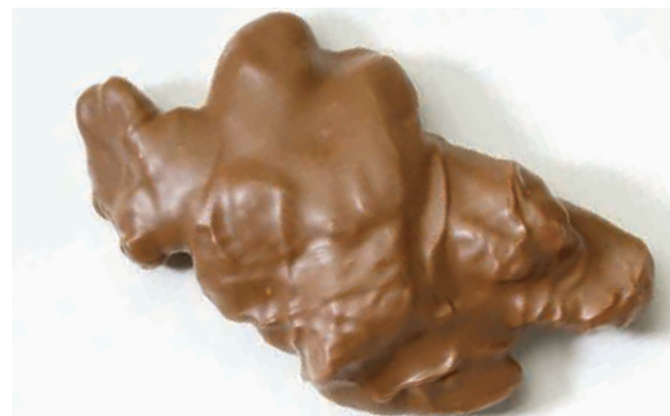
F101320311838 - Milk Pecan Caramel Bar