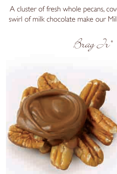
FI01280830001 - .5 oz Milk Pecan