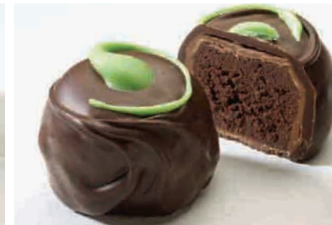
F101420211497 - Dark Swiss Mint Decadent dark chocolate center blended with peppermint oil, dipped in milk chocolate, then in dark chocolate.