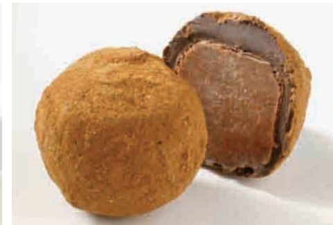
F101420212975 - Abuelito's Mexican Hot Chocolate

White chocolate center with maple flavoring and walnut pieces dipped in white chocolate then in milk chocolate topped with a walnut.