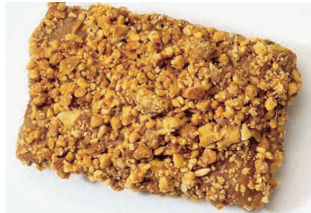
F101420311708 - Almond Toffee Bar