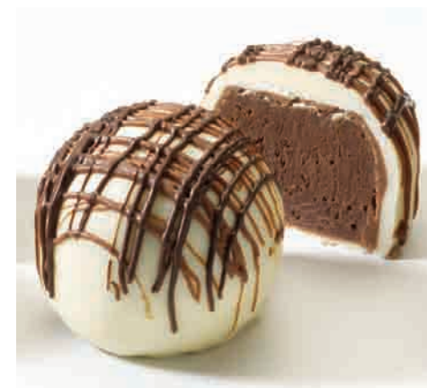
F101420211541 - Amaretto Dark chocolate center with amaretto liqueur flavor, dipped in milk chocolate, then in white chocolate.