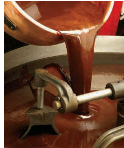
Handmade chocolates have centers that are blended fresh in small batches before dipping.

where every gourmet chocolate is handcrafted by skilled artisans and considered a masterpiece... a delight for the eyes as well as the palate. We begin by simmering select natural ingredients in large copper kettles... fresh whipping cream, pure butter and the finest quality chocolate. Each decadent Grand Truffle center is hand-rolled and twice-dipped in chocolate, then "autographed" for that personal touch. Our signature Fudge Love®, Famous Brags® and traditional pieces receive the same attention to detail. The final creations are carefully inspected by hand before we present them to you, our valued customer. We hope you enjoy!