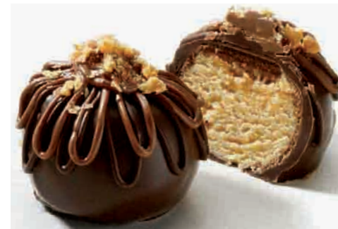
F101200212838 - Big Wigs™ Peanut butter center coated with milk and dark chocolate, hand piped, and topped with crushed peanuts.