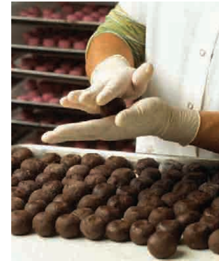
Sweet Shop USA® truffles are patiently rolled by hand, imparting a unique character and delicate texture.