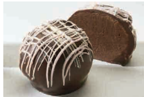
F101420211473 - Dark Champagne

Italian Cream Cake, with creamy vanilla-cake-flavored ganache blended with roasted pecans and coconut, hand-dipped in Belgian white chocolate couverture