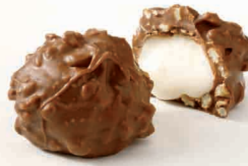
F201450010014 Milk Chocolate Annaclairs®