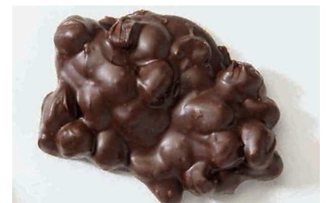
F101320311883 - Dark Peanut Bar