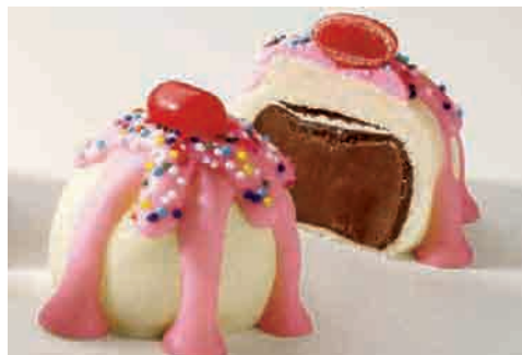
F101200212814 - Birthday Party™ White chocolate with Fudge Love® center, dipped first in dark chocolate, then in white chocolate, drizzled with pink chocolate, topped with sprinkles and a jelly bean.