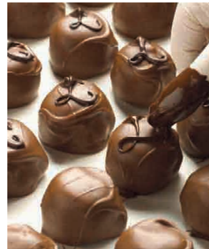
Personal gifts demand a personal touch! We hand-sign each truffle as a personal pledge of our dedication to your complete satisfaction.