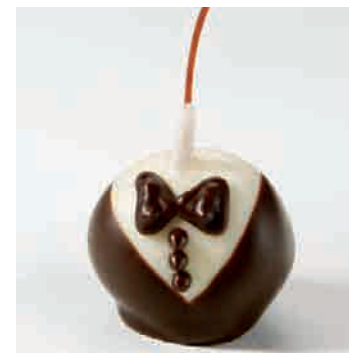
F101500211312 Double-Dipped Tuxedo Cherry