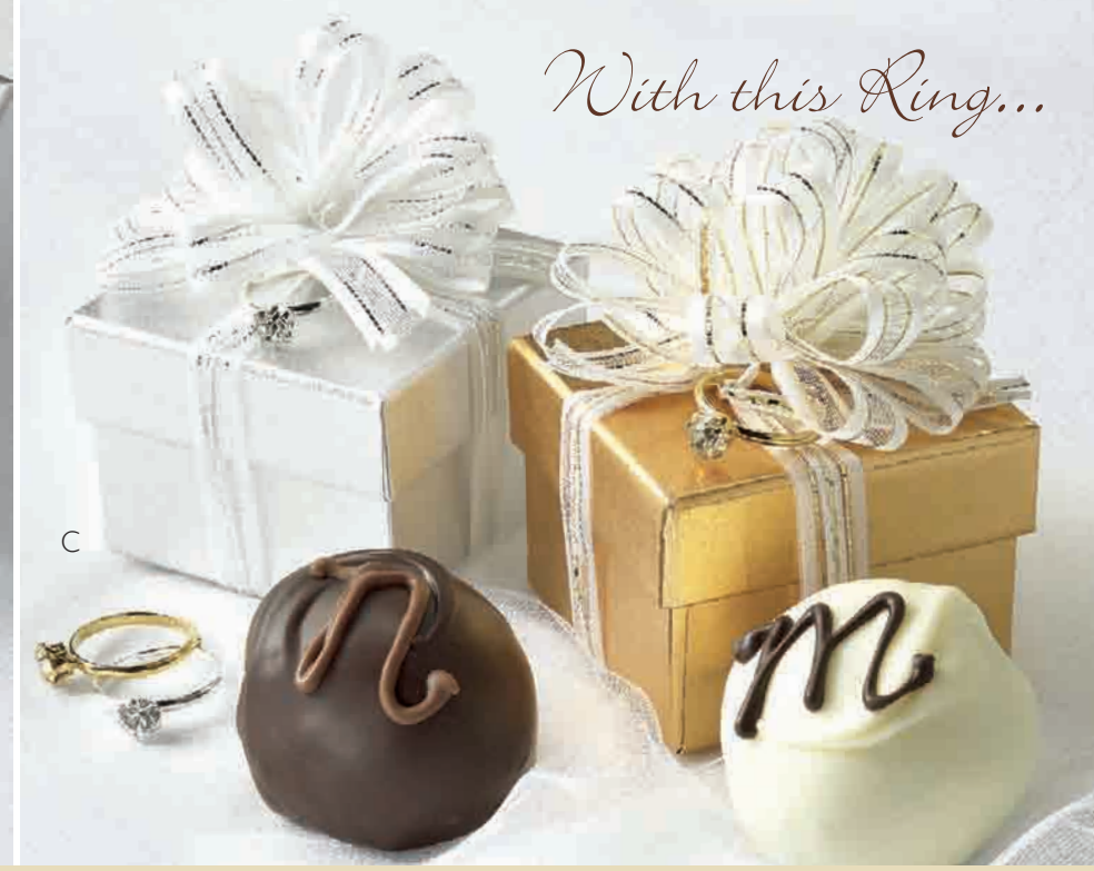
With this Ring...