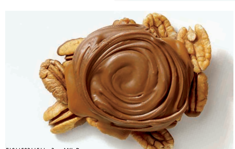
FI01150311511 - 3 oz Milk Pecan