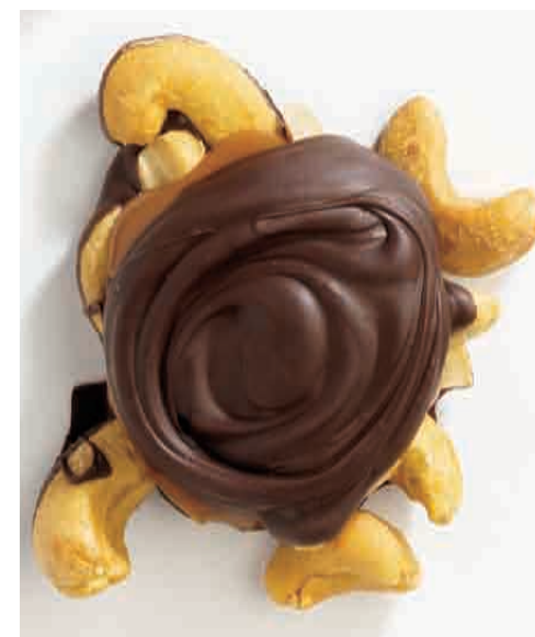
FI01320313092 - 1.5 oz Dark Cashew