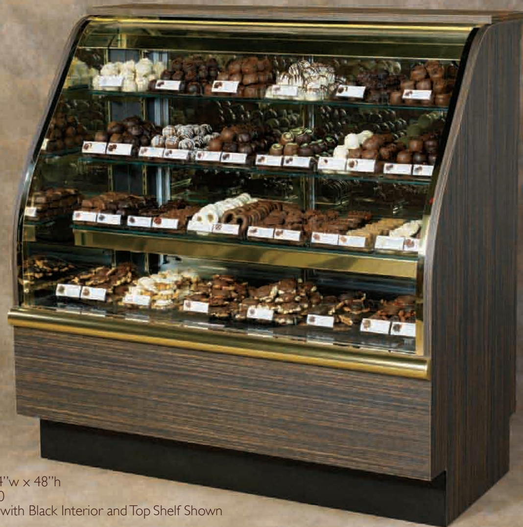
48"l x 24"w x 48"h G750500 Style D with Black Interior and Top Shelf Shown