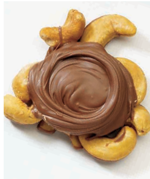
FI01320313054 - 1.5 oz Milk Cashew