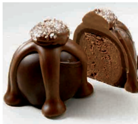
F101200212951 - Sea Salt Caramel Luscious caramel blends with milk chocolate ganache center, dipped in dark chocolate, then drizzled with milk chocolate and sprinkled with sea salt.