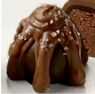
F101420214955 Sea Salt Caramel Luscious caramel blends with milk chocolate ganache center; dipped in dark chocolate, then drizzled with milk chocolate and sprinkled with sea salt.