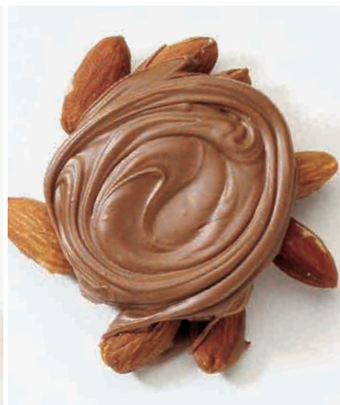
FI01320313016 - 1.5 oz Milk Almond