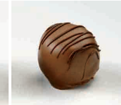
Petite Truffle .5 oz