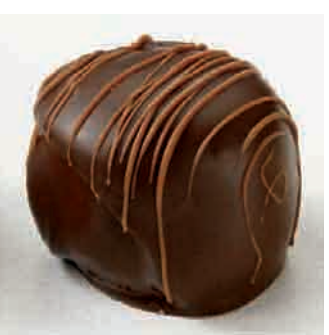
F101280811635 Double Chocolate Rich dark double chocolate center; dipped in milk chocolate, then in dark chocolate.