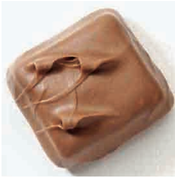
F101640311104 Milk Caramel