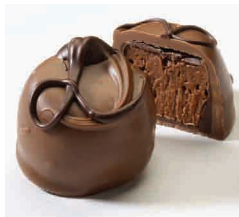
F101420211671 - Fudge Love® Our signature truffle with a milk chocolate, whipped cream center, immersed in dark chocolate, then in milk chocolate.