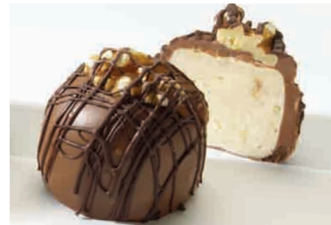
F101420211848 - Maple Walnut

Rich dark chocolate center blended with champagne flavoring, double-dipped in dark chocolate.