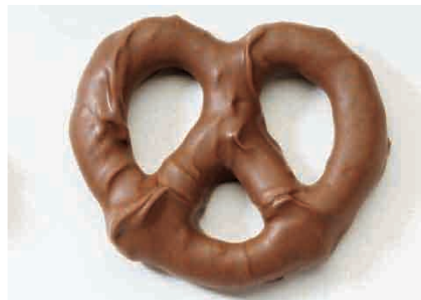
F101350111193 - Milk Pretzel