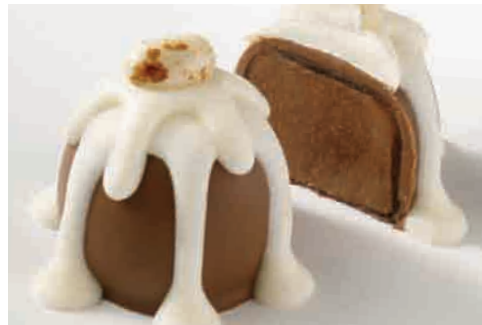
F101200213002 - Gimme S'More

Carrot Cake, a carrot-cake-inspired ganache hand-dipped in Belgian white chocolate couverture