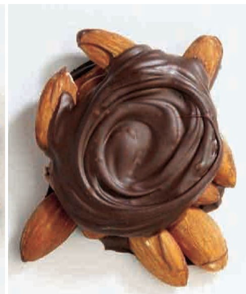
FI01320313078 - 1.5 oz Dark Almond