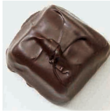
F101640311142 Dark Caramel