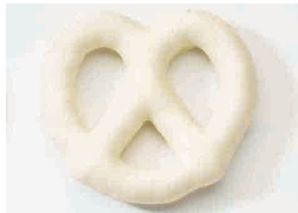
F101350111186 - White Pretzel