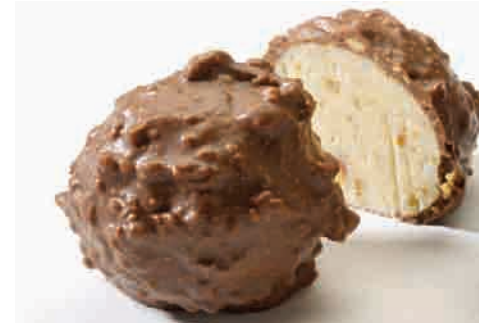
F101420211831 - Butter Toffee Creamy white chocolate center blended with butter toffee flavor; immersed in white chocolate, then in milk chocolate with almond bits.