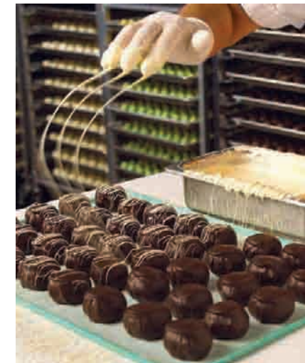
Details such as "handstringing" very fine designs on our chocolates produce delicious, eye catching creations. It takes skilled human hands to produce these unique patterns.