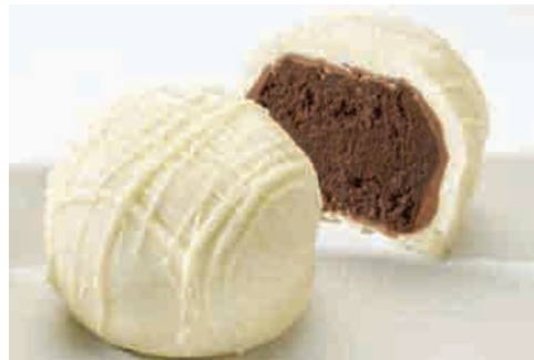
F101420211411 - Triple Chocolate Deep dark chocolate center dipped in milk chocolate, then in white chocolate.