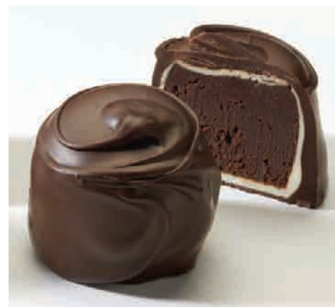
F101420211657 - Black Forest Luscious cherry purée and dark chocolate center, dipped in creamy white chocolate, then in dark chocolate.