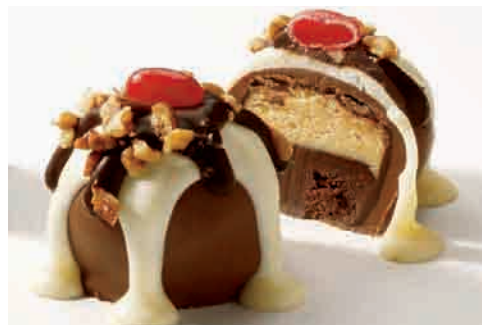
F101200212845 - Sundae Bash™ Peanut butter layered over a dark chocolate ganache center; immersed in dark chocolate, then milk chocolate, drizzled with white and dark chocolate, topped with roasted pecans and a jelly bean.