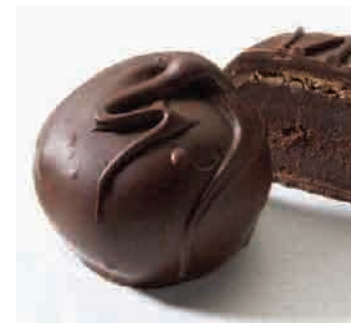
F101840412450 Dark Vanilla Truffle