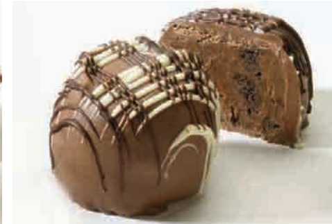
F101420211404 - Chocolate Cookie Luscious milk chocolate center blended with Oreo® cookie bits, dipped twice in milk chocolate.