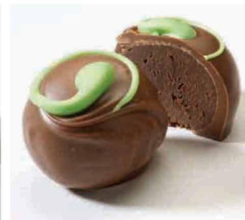
F101420211503 - Swiss Mint Rich dark chocolate center infused with peppermint oil, dipped in dark chocolate, then in milk chocolate.