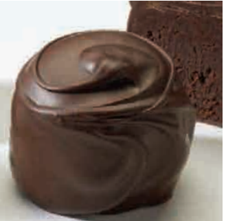
F101840213651 Black Forest Luscious cherry purée and dark chocolate center; dipped in dark chocolate.