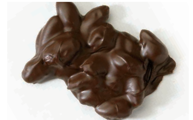
F101320311746 - Dark Almond Bar