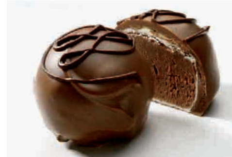
F101420212944 - Double Latte

White chocolate center with birthday cake flavor; twice dipped in milk chocolate, drizzled in pink and yellow, topped with sprinkles and a jelly bean.