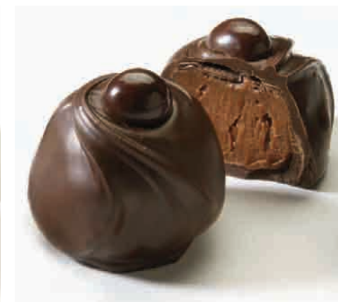
F101420211565 - Espresso Café Ground coffee beans and dark espresso café-flavored center, dipped in milk chocolate, then in dark chocolate and topped with a chocolate-covered espresso bean.