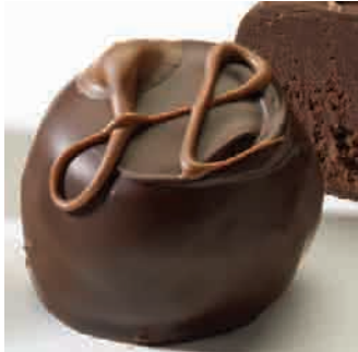
F101840213637 Double Chocolate Rich dark double chocolate center; dipped in dark chocolate.