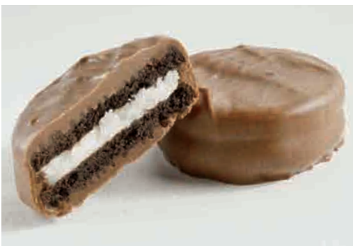
F101560700830 Chocolate-Covered Oreo®