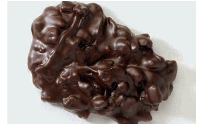
F101320311784 - Dark Pecan Bar