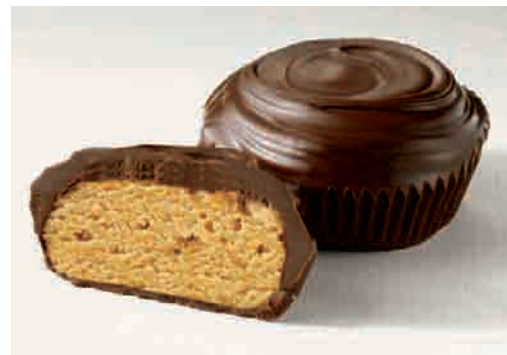
F101420311074 Dark Peanut Butter Cup