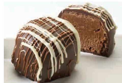
F101420211756 - Cappuccino Milk chocolate center blended with rich cappuccino coffee, dipped in milk chocolate, then in dark chocolate.