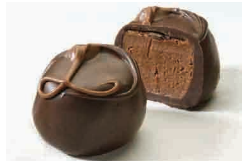
F101420211480 - Dark Fudge Love® Our signature truffle with a milk chocolate, whipped cream center, immersed twice in dark chocolate.