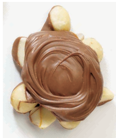
FI01320313139 - 1.5 oz Milk Macadamia