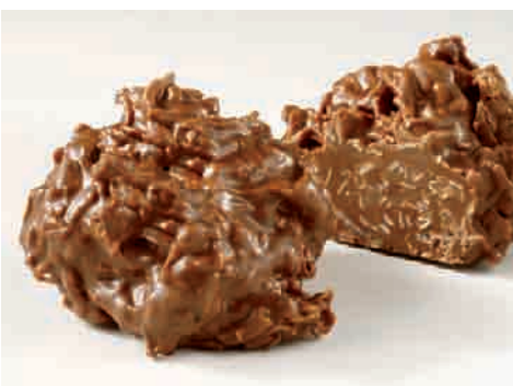
F101480111100 Milk Haystacks