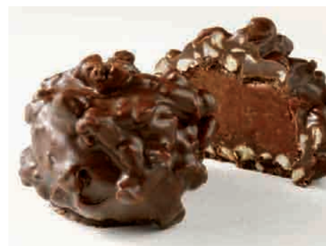
F101420111025 Dark Fudge Love®