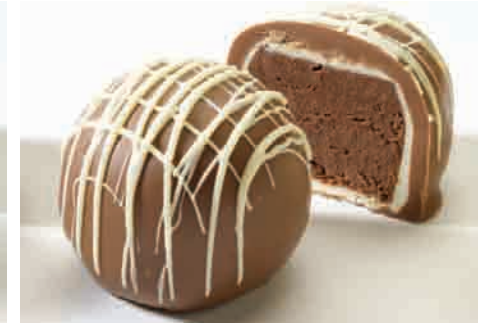
F101420211572 - Champagne Milk chocolate center infused with champagne flavor; dipped in white chocolate, then in milk chocolate.